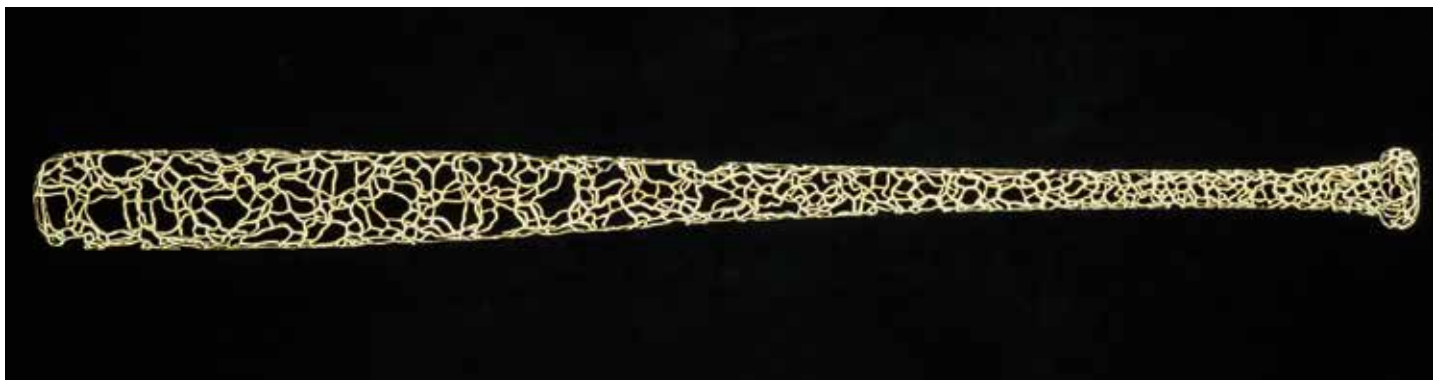
Arthur Jones , Soul of the Game , 1997, Maple, 35" x 2½" (89cm x 6cm)