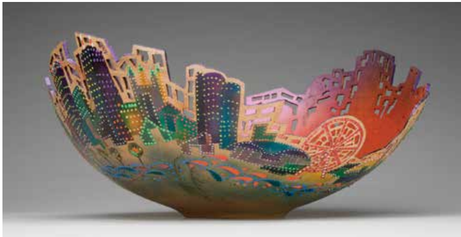
Binh Pho , Chicago IV , 1999, Maple, acrylic paint, dye, 12" (30cm) diameter

The use of air-powered, high-speed tools has become the standard for fine piercing, but it is not the only way. Most people would call the ▶