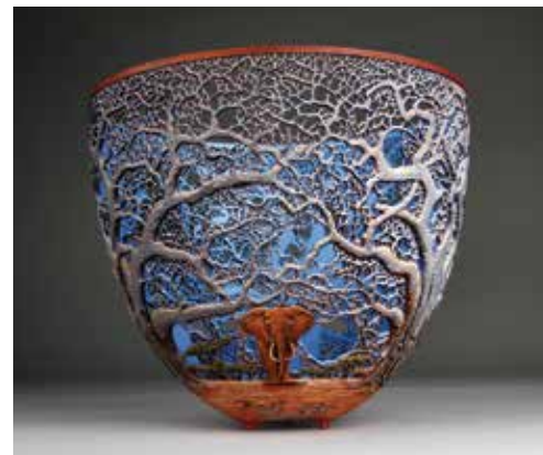
Gordon Pembridge , The Red Elephants of Tsavo , 2014, Macrocarpa, acrylic paint, 5¾" × 6¾" (15cm × 17cm)