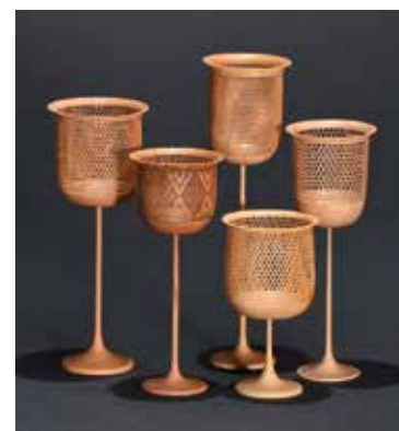
Steve Sinner , Goblets , 2005, Sugar maple, heights are 2½" to 4" (6cm to 10cm), diameters are 1" to 2" (25mm to 5cm)

Different hole sizes for different wall thicknesses.