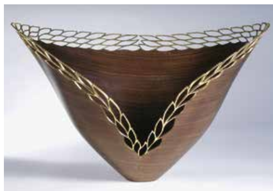
Malcolm Zander , Leaves in a Golden Wind , 2008, Walnut, 23K gold leaf, 9½" × 15½" × 11½" (24cm × 39cm × 29cm)

Different hole sizes for different wall thicknesses.