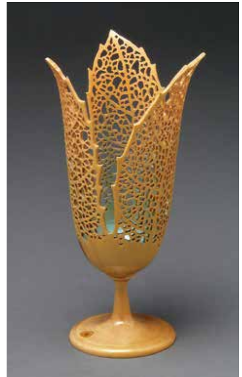
Frank Sudol , Goblet , 1994, Birch, paint, 6½" x 3½" (17cm x 9cm)

An early example of the use of a dental drill for piercing.