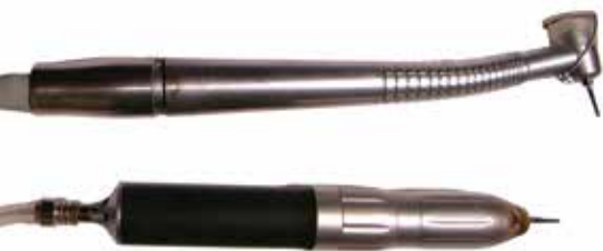
Air-powered tools: dental drill (top) and NSK tool.

made of carbide, have a \frac{1}{16} "-diameter \times \frac{3}{4} "-long (1.6mm \times 19mm) shank, and are identified by the prefix FG (Friction Grip). Most commonly used are the FG 699L and the FG169L. The 699L has radial chip breaker grooves and removes stock faster than the 169L, which lacks these grooves but leaves a cleaner cut. Also used are the FG700L and FG170L, which have a slightly larger-diameter cutter.